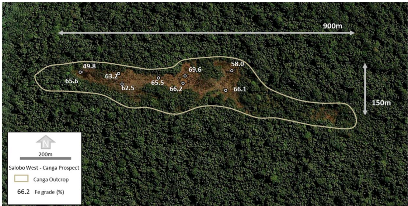
Figure 2 – Salobo West Canga Outcrop - Location of Rock Chip Samples