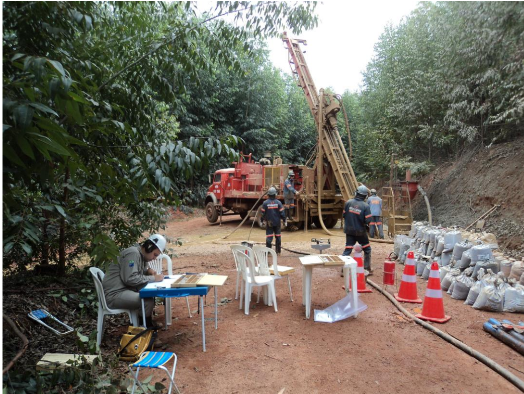
Figure 1 – Geosedna RC Rig drilling at Jambreiro Project