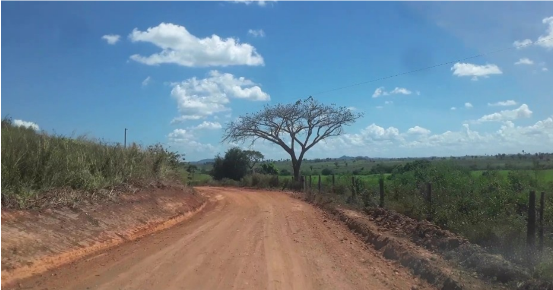
Figure 1 – Farmland at the Jaguar Nickel Sulphide Project.

The Jaguar Project is located in an area of already cleared farm land (Figure 1). Over the course of the last six months the Company has acquired possession of two properties (1,550 hectares) that overlay the Jaguar Project. A third agreement is presently being negotiated. The existing agreements will assist the approval process as the majority of the farmland potentially impacted by the Project is now controlled by Centaurus.