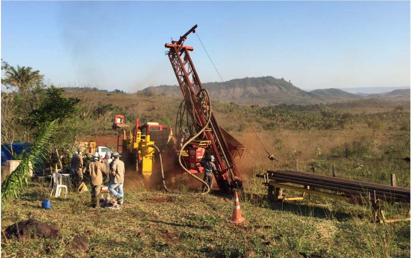
Figure 3 – RC rig drilling at drill hole PBS-RC-18-001

The Filhote Target zone consists of an 800m long, +500 ppm copper anomaly coincident with a magnetic signature and interpreted structural zone. There has been no historical drilling on the Filhote Target. The Company has planned a number of drill holes to test the copper-in-soils anomaly.